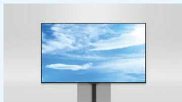
Optical-use poval film