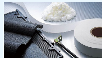
KURALON™, KURALON K-II™ PVA fiber