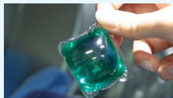
Water-soluble PVOH film