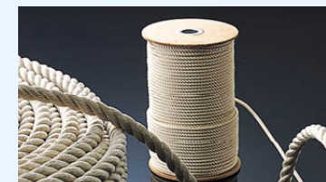
VECTRAN™ liquid crystal polymer fiber

*2 In the high performance structural and stiff interlayer for the architectural glazing market