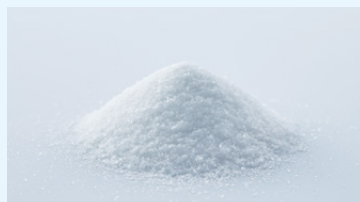
PVOH resin (excluding China)