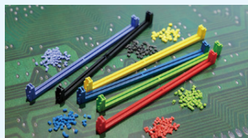
GENESTAR™ heat-resistant polyamide resin