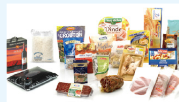
EVAL™ EVOH resin (ethylene vinyl alcohol copolymer)