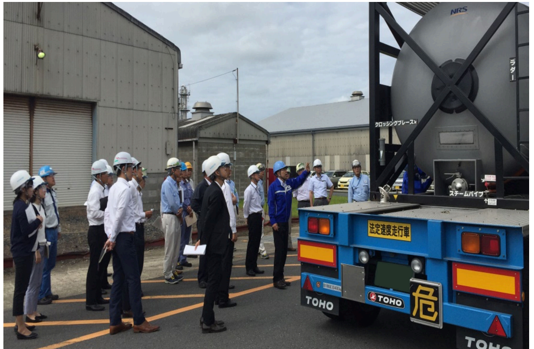
Kuraray Logistics Safety Conference holds a study group regarding ISO containers used to transport products made of hazardous materials (at Kashima Plant).