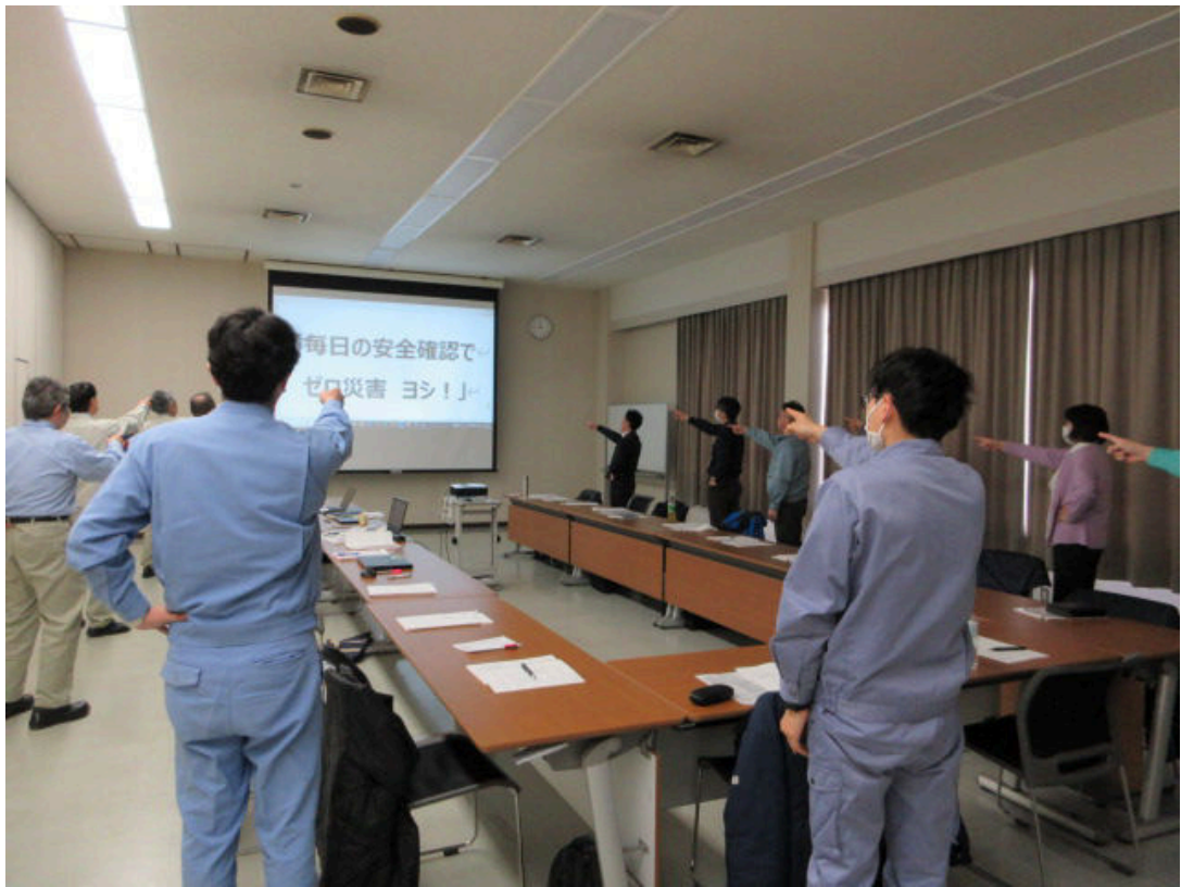
Meeting on Safety and Health Council, Transportation and Operations Subcommittee (at Niigata Plant)