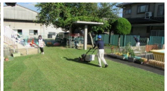
Mowing Lawns at the Children's Gardens