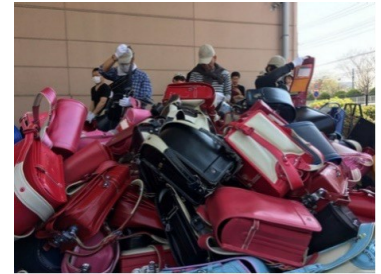
Sending School Backpacks Across the Sea

Although, given its location in an office area, the Tokyo Head Office has limited direct contact with the local community, it does engage with other companies working in the same building. For example, it participates in tenant exchange sports events hosted by the building owner company, donates emergency stockpiles for disasters, and subsidizes employees' social contribution activities. In addition, the Tokyo Head Office is also responsible for promoting the "Sending School Backpacks Across the Sea" campaign, managing the Kuraray Foundation, and managing donations related to social contributions.