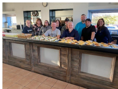
Meals Served in La Porte Community Center.

As well as these events, MonoSol, LLC is working as a company to reduce its carbon footprint outside of direct production activities. Styrofoam cups and disposable plastic bottles have been replaced with eco-friendly paper cups. In fiscal 2023, MonoSol plans to launch a program to reduce the amount of paper used for various records and data tracking.