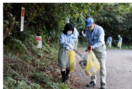
Local Cleanup Activities