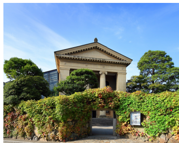
Ohara Museum of Art

Kuraray was founded in Kurashiki City, an area of Japan that is steeped in culture. Although our founder lived during the Meiji era, as Japan was just opening back up to the rest of the world, he collected Western paintings for local citizens. This led to the establishment of the Ohara Museum of Art, which is famous worldwide. Since its birth, Kuraray has valued culture. We support many cultural facilities and cultural activities, including the Ohara Museum of Art and the Ehime Folk Crafts Museum, and other cultural facilities associated with Kuraray, honoring researchers of Japanese culture at the Kuraray Foundation, restoring paintings, and training young artists.