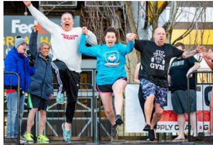
Special Olympics Polar Plunge