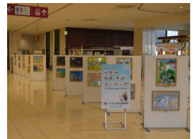
18th Painting and Calligraphy Contests

In Okayama, we focus on educational support activities and cleanup activities. We call for submissions of paintings and works of calligraphy from nearby elementary schools and regularly hold painting and calligraphy contests at commercial facilities. Through the Kuraray Fureai Fund, we also continue to donate books to elementary schools. In 2022, we took part, on a reduced scale, in a cleanup of Lake Kojima. Sports competitions, festivals, and the Fun Chemistry Class have been suspended, but we are considering the content of the event with the aim of restarting it in fiscal 2023. As a new initiative, we also held a Friendship Golf Competition with local people. The reception party gave us an opportunity to report on the status of the plant and engage in conversation with the attendants.