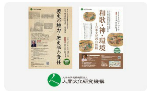
Supporting the National Institutes for the Humanities