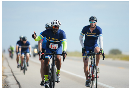
Clean-up of the Galveston Bay Watershed

As a responsible corporate citizen, our first priority is to contribute to the communities in which our plants are located, and we focus on education - especially STEM -, environmental protection, health and safety, and promoting understanding of Japanese culture. We have also developed social action guidelines and support our employees' active engagement through matching gifts and volunteer grant program. In 2022, we again participated in the Trash Bash, the largest Gulf clean-up in Texas organized by the Galveston Bay Foundation, where employee volunteers worked to protect the Bay ecosystem and surrounding areas. We also participated in Bike Around the Bay, which helps protect the Bay's environment. In addition, they supported an initiative organized by the non-profit foundation Habitat for Humanity Baytown to provide economically priced housing to families in need. During the Christmas season, employees organized a donation drive at the non-profit foundation Depelchin Children's Centre to purchase toys and other gifts and household items. In addition, employees participated in the Fayetteville International Folk Festival, a cultural event, and in GEMS (Girls Exploring Math and Science) activities at the Houston Museum of Natural Sciences.