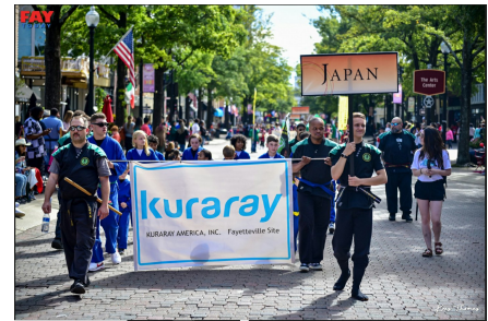
Fayetteville International Folk Festival