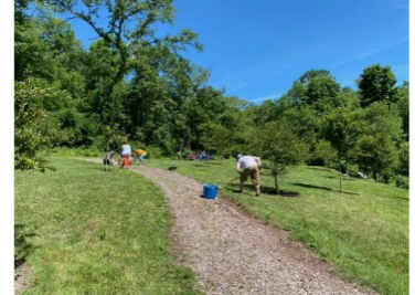
Cleanup the local Pittsburgh Botanic Gardens

Every year, a team of employees join United Way to serve people in need in nearly every region of southwestern Pennsylvania. Employees also volunteered to clean the local Pittsburgh Botanic Gardens. They also participated in the Special Olympics Polar Plunge. This event supports people with intellectual disabilities in Pennsylvania. We also participate in various job briefings throughout the year. In 2023, as local communities reopen, we will do more.