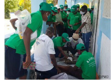
Training in Cashew-Processing by Peace Winds Japan in Haiti

Kuraray has a large-scale disaster support policy and provides assistance to areas that have been severely affected. Although the focus is on the Group's base regions, as mentioned above, when a disaster is judged to be of global scale, we aim to select qualified targets for donations so that we can quickly support relief efforts. While Kuraray focuses on the initial response, the Kuraray Foundation, which operates with a longer-term perspective, responds to new needs that arise as efforts transition to the recovery phase.