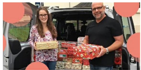
Christmas in a Shoebox