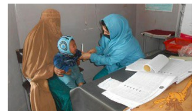
Mother and Child Medical Care in Afghanistan

In Japan, Kuraray has been carrying out its “Sending School Backpacks Across the Sea” campaign for many years. Backpacks used by elementary school students are collected and these are given to Afghan children with stationery and letters inside. Recognizing the difficult situation faced by local children and mothers, the Kuraray Foundation is now providing support for specialized in mother and child medical care through the NGO JOICFP.