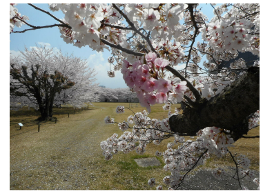
Cherry Blossom Photography Event

Saijo Plant usually holds an annual cherry blossom viewing party in April each year, which is attended by a large number of people from the local community. Instead of this event, which has unfortunately been on hold, a cherry blossom photography event was held in which local people were invited to take photos. Every year, we donate books to local elementary schools through the Kuraray Library program. Although we did not carry out “Exciting Chemistry Class,” our program of chemistry classes for elementary schoolchildren, we plan to resume this from fiscal 2023. We have also supported the Ehime Folk Crafts Museum in the cultural area of Saijo City for many years.