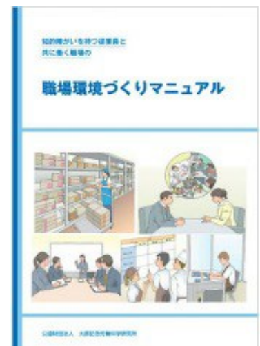
Manual for creating a workplace environment for working with employees with intellectual disabilities

Kuraray is committed to employing people with disabilities. From 1997, we established Kuraray workshops at Kuraray's five plants in Japan, providing places for people with intellectual disabilities to work. In addition, the Kuraray Foundation supports the Ohara Memorial Institute for Science of Labour, a public interest incorporated foundation, to help promote the employment of people with disabilities in corporations. The institute conducts research using labor science methods on how to solve problems related to the employment of people with intellectual disabilities and their retention after employment, and provides research results to the public.