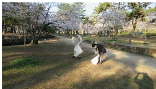
Clean-up Activities in Sakazu Park

At Kurashiki Plant, we continued to hold events such as sports events (boys' soccer tournaments) and festivals (a summer festival and a "Christmas Fantasy" event). Although these were scaled down, sponsored or held in a simplified format, they enabled members of the plant to continue to interact with local people. We also promoted volunteer activities that could be carried out even during the COVID-19 pandemic, such as cleaning local parks, rivers, and children's gardens and mowing lawns. The Fun Chemistry Class, our chemistry classes for boys and girls, had been on hold, but we are exploring ways of restarting it in fiscal 2023. As a fundraising activity, we continued our donation matching program, the Kuraray Fureai Fund, through which we donate playground equipment to local elementary schools and children's gardens.