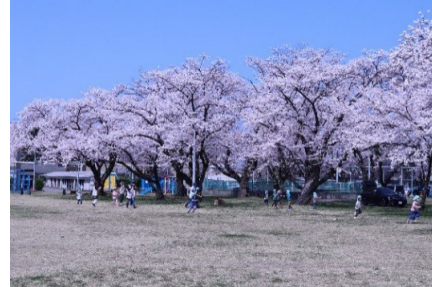
Cherry Blossom Viewing Party