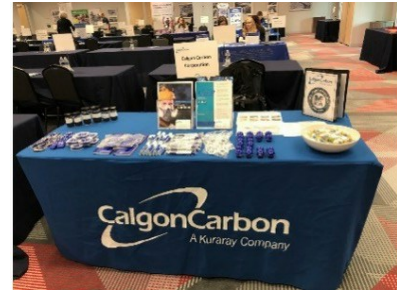
Participation in Job Fair

As well as the above-mentioned initiatives, the Kuraray Group will put its heart into carrying out social contribution activities wherever it has bases around the world.