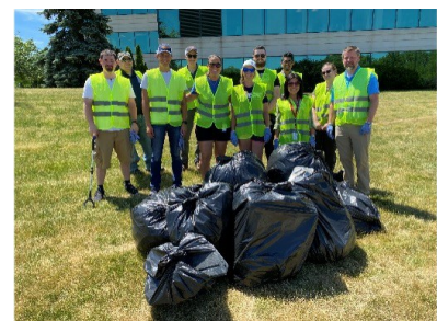
Cleanups in Local Beaches and Roads