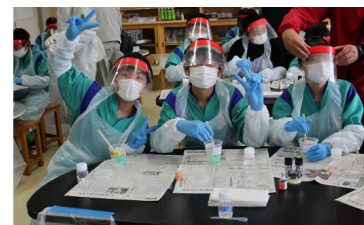
Fun Chemistry Class

The Fun Chemistry Class was held by visiting an elementary school with full COVID-19 prevention measures in place. Smiles could be seen, despite the masks and face shields, in an enjoyable class that lived up to its name. Each year at the Kashima Plant we donate books to local elementary schools through the Kuraray Fureai Fund. During visits to the schools, members of the plant explain our “Sending School Backpacks Across the Sea” campaign to the principals and request donations of school bags that have been used for six years. Recreational activities with local residents (the Mama-san volleyball tournament and the athletic meeting with facilities for people with disabilities) have unfortunately been suspended, but the aim is to restart them in fiscal 2023.