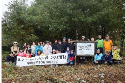
18th MIRABAKESSO Forest Creating Activity