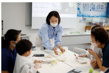
Open Chemistry Class

At the Tsurumi Plant, we long for children to become interested in chemistry by carrying out hands-on experiments, and we also want members of the local community to learn more about our plant. So, since 2019, the plant has held an open chemistry class in collaboration with the local tourism association. This event was held again in fiscal 2022. In fiscal 2023, a biodiversity learning event is planned as a new initiative. With a slogan of protecting the richness of the sea and land and creating a city we can continue living, we are also actively engaged in local cleanup activities. Many employees participate in picking up trash in areas around the plant, such as the waiting area of the Okayama Blue Line and nearby prefectural roads, and also in maintaining the grounds of a local elementary school.