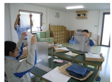
Aozora Blue Sky Works of the Kashima Plant