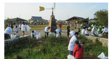
The Tamegawa River volunteer cleaning work by the Kurashiki Plant

Kuraray Europe GmbH (KEG) donated 10,000 euros to help victims in the Ahrtal region of Germany, where a flood disaster in July 2021 caused extensive damage along the river. In addition, employees belonging to Kuraray Europe collected and donated 4,115 euros for reconstruction work.