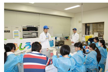
Fun Chemistry Class at the Kurashiki Plant

In 2021, we refrained from holding in-person events at business sites in accordance with the events policy formulated in response to the COVID-19 pandemic. However, we held remote classes at business sites and local elementary schools (once at Kashima Plant) and at local cultural facilities outside the company (twice at Tsurumi Plant).