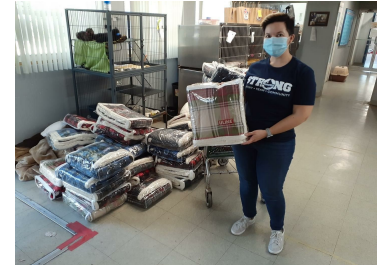
MonoSol: Donation to local communities