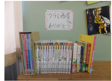
Kuraray Library financed by Kuraray Fureai Fund by the Saijo Plant

Although the pandemic has put constraints on activities, MonoSol, LLC, is devising support activities that all employees can participate in. Initiatives include outdoor service activities (cleaning local beaches, highways, and