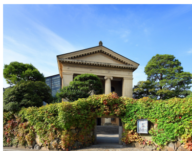
The Ohara Museum of Art