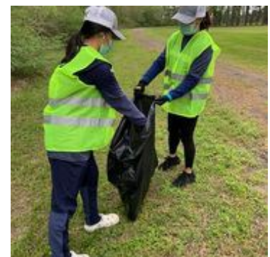
Kuraray America: Trash Bash event

Kuraray America, Inc. has partnered the foundation since 2014. Trash Bash® is one of the foundation's largest cleanup events in Texas for Galveston Bay. The Galveston Bay Foundation is a conservation nonprofit that has served as guardian of Galveston Bay since 1987. Since 2015, Kuraray America, Inc. has participated in the Trash Bash® event each year. In March 2021, Trash Bash® was switched