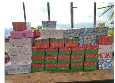
Kuraray Europe: Christmas in a shoebox