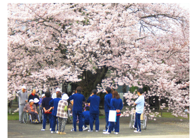
Cherry blossom viewing party held at the Saijo Plant

In cooperation with Nakajo Town (currently Tainai City) and Niji no Ie (meaning “Rainbow House”, operated by a social welfare corporation, Nanaho-kai), the Kuraray Workshop of Kuraray’s Niigata Plant opened in 1997 for people with intellectual disabilities. Participants in the workshop sort plastic waste generated in the production process for recycling and manufacture supplies and fittings. In 2007, the Himawari Sunflower Workshop opened at Kuraray’s Saijo Plant. In 2011, the Kashima Plant opened its Aozora Blue Sky Works assisted by a social welfare corporation, Kamisu Keiai-en. In 2017, Okayama Plant opened cleaning center ALESCO, assisted by the same organization. Currently, 15 instructors and 42 workers work at five of Kuraray’s plants to accomplish a variety of job assignments, including those employees at Kuraray’s Kurashiki Plant engaged in cleaning uniforms and labeling Kuraray products. They mingle with Kuraray’s employees through sports events and other occasions. We will continue to hold these workshops and employ persons with intellectual disabilities.