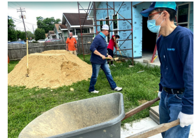
Kuraray America: Habitat for Humanity