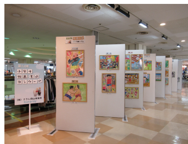
Contest on Painting and Calligraphy at the Okayama Plant

Okayama Plant has been holding the Elementary School Student Painting and Calligraphy Contest annually since 2005. Having been well recognized in the local community thanks to its ongoing successes, this contest received 554 artwork entries, including paintings, pictures, and calligraphy, from five elementary schools near the plants in fiscal 2021. This contest will be continuously sponsored.