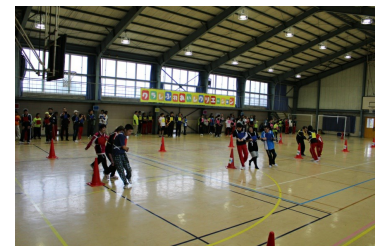
Fureai Recreation event at the Kashima Plant