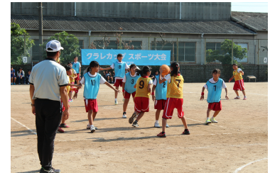
Kuraray Cup sports event at the Okayama Plant

Kuraray is offering its baseball parks, gymnasiums, and tennis courts to neighbors for the promotion of sports in neighboring areas. These activities will be continued in the future.