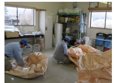
Kuraray Workshop of the Niigata Plant