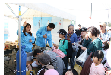
Booth at the Bizen Industrial Festa by the Tsurumi Plant