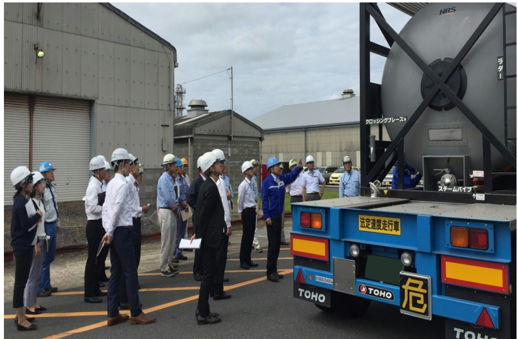
Kuraray Logistics Safety Conference holds a study group regarding ISO containers used to transport products made of hazardous materials (at Kashima Plant).

We will improve the shipping and filling equipment for hazardous materials and review the procedure.